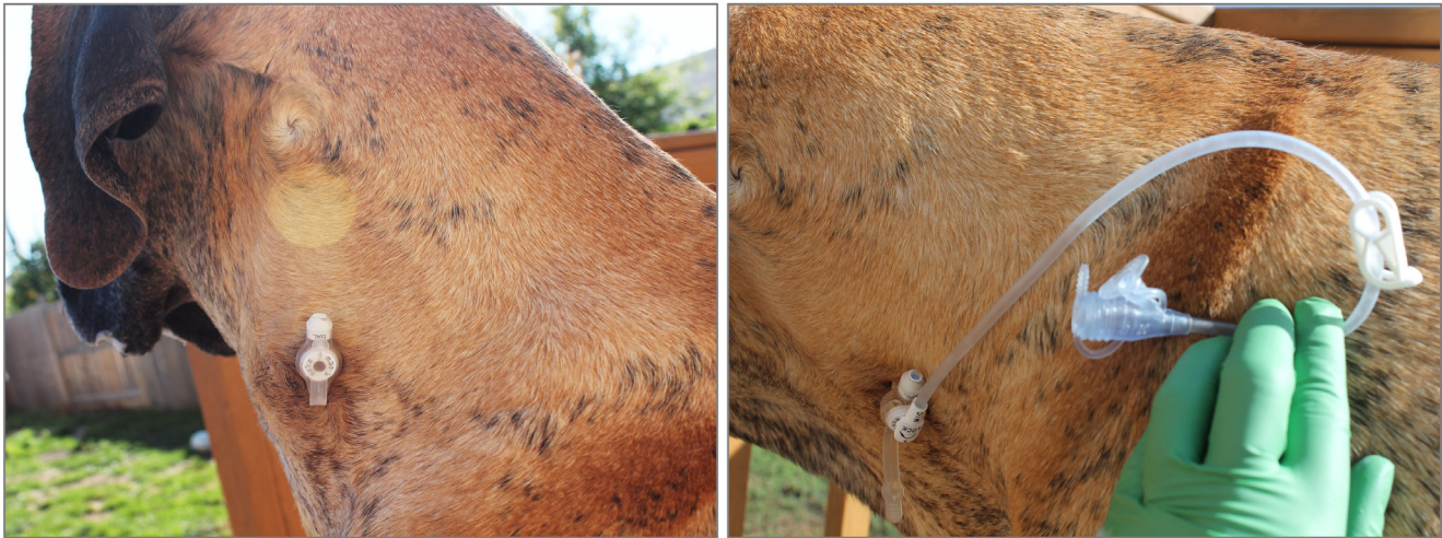
FIGURE 4 Mic-Key LP “button” J tube (left) and with locking extension tubing attached (right)

after suture removal healed within approximately 10 days. The tube tip is slightly bulkier than the rest of the tube, and because of its flexibility this tube was more difficult to place. The tube's flexibility derives in part from antikink technology, which resembles a metal “slinky” spring in the wall of the tube, and may prove useful in decreasing the frequency of tube displacement. Regarding functionality, the G-port and extension were very easy to use for administering liquid sucralfate to the esophageal mucosa. The J-port and extension also were used with ease for feeding liquified kibble of the same consistency as used with the standard E-tube. The ports were difficult to confuse because they each have a different extension set that will not fit the other port. This tube did not appear to become discolored or degrade during the 4-week trial and potentially could have been used for a longer time period. The button system appeared overall to be easier to use than the standard E-tube because, subjectively, it caused less disturbance to the dog and had a 30 cm extension set so that syringe reloading, connection and disconnection could be accomplished more easily. Subjectively, the dog showed greater acceptance of this intervention compared to the standard E-tube and did not try to remove the tube. An Elizabethan collar was not required. The only disadvantage was the high cost, of approximately $750 USD.