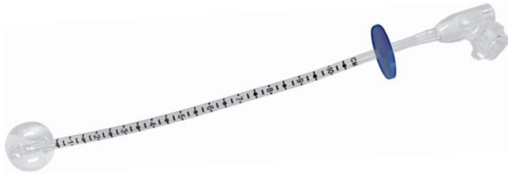
FIGURE 3 Stoma measuring device (Applied Medical Technologies). The tube is introduced into the stoma, and the balloon is inflated and gently pulled until slight resistance is felt. The stoma length can then be measured

pharynx and could result in aspiration, but it can be used to administer liquid sucralfate. An antireflux valve in the G- and J-ports prevents backflow during feeding. The G-Jet is produced in 14, 16, and 18 Fr sizes with stoma lengths ranging from 1 to 6 cm and jejunal length from 15 to 45 cm (Table 1). The “button” on this device has small “feet,” allowing the skin around the stoma to stay dry and open to the air which can help to prevent infection. Antikink technology is incorporated, with a lightweight spiral of metallic wire in the wall of the tube. The “Mic Key” LP J-tube (Kimberly Clark/Avanos Medical) is a medical-grade, balloon-style silicone tube with a jejunal port that has an antireflux valve. It is produced in 14 and 18 Fr sizes, for stoma lengths from 0.8 to 4.5 cm and supplied in a standard tube length of 51 cm, to be cut to requirements before use. For feeding, a Mic Key-specific extension set is attached to the “button.” The extension sets for both tube types can be reused if cleaned after each use.