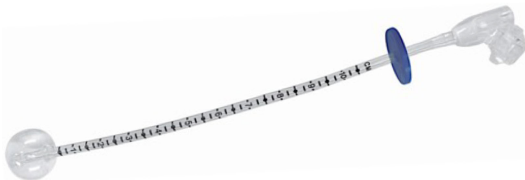
FIGURE 3 Stoma measuring device (Applied Medical Technologies). The tube is introduced into the stoma, and the balloon is inflated and gently pulled until slight resistance is felt. The stoma length can then be measured

pharynx and could result in aspiration, but it can be used to administer liquid sucralfate. An antireflux valve in the G- and J-ports prevents backflow during feeding. The G-Jet is produced in 14, 16, and 18 Fr sizes with stoma lengths ranging from 1 to 6 cm and jejunal length from 15 to 45 cm (Table 1). The “button” on this device has small “feet,” allowing the skin around the stoma to stay dry and open to the air which can help to prevent infection. Antikink technology is incorporated, with a lightweight spiral of metallic wire in the wall of the tube. The “Mic Key” LP J-tube (Kimberley Clark/Avanos Medical) is a medical-grade, balloon-style silicone tube with a jejunal port that has an antireflux valve. It is produced in 14 and 18 Fr sizes, for stoma lengths from 0.8 to 4.5 cm and supplied in a standard tube length of 51 cm, to be cut to requirements before use. For feeding, a Mic Key-specific extension set is attached to the “button.” The extension sets for both tube types can be reused if cleaned after each use.