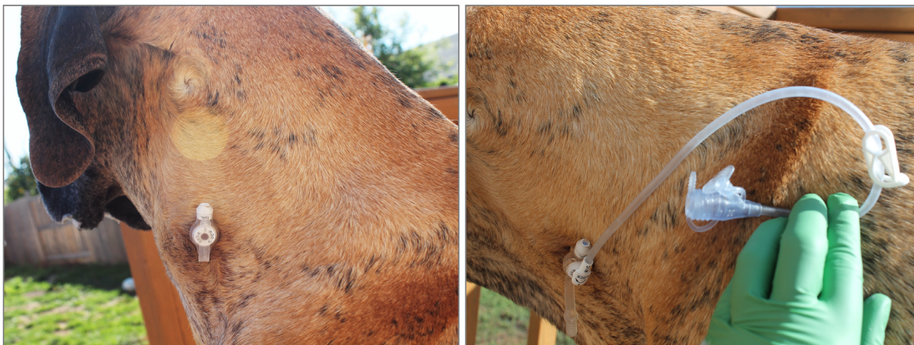
FIGURE 4 Mic-Key LP “button” J tube (left) and with locking extension tubing attached (right)

after suture removal healed within approximately 10 days. The tube tip is slightly bulkier than the rest of the tube, and because of its flexibility this tube was more difficult to place. The tube's flexibility derives in part from antikink technology, which resembles a metal “slinky” spring in the wall of the tube, and may prove useful in decreasing the frequency of tube displacement. Regarding functionality, the G-port and extension were very easy to use for administering liquid sucralfate to the esophageal mucosa. The J-port and extension also were used with ease for feeding liquified kibble of the same consistency as used with the standard E-tube. The ports were difficult to confuse because they each have a different extension set that will not fit the other port. This tube did not appear to become discolored or degrade during the 4-week trial and potentially could have been used for a longer time period. The button system appeared overall to be easier to use than the standard E-tube because, subjectively, it caused less disturbance to the dog and had a 30 cm extension set so that syringe reloading, connection and disconnection could be accomplished more easily. Subjectively, the dog showed greater acceptance of this intervention compared to the standard E-tube and did not try to remove the tube. An Elizabethan collar was not required. The only disadvantage was the high cost, of approximately $750 USD.